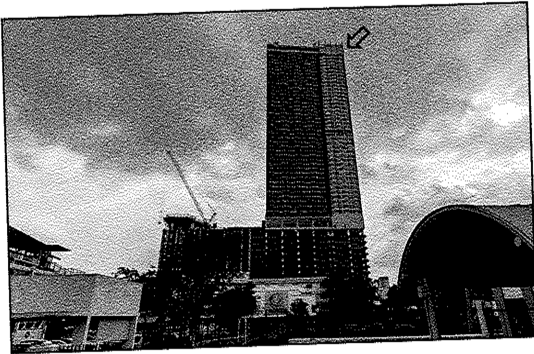
VIEW OF THE RIV @ RIVERIA CITY, WHERE THE SUBJECT PROPERTY IS LOCATED