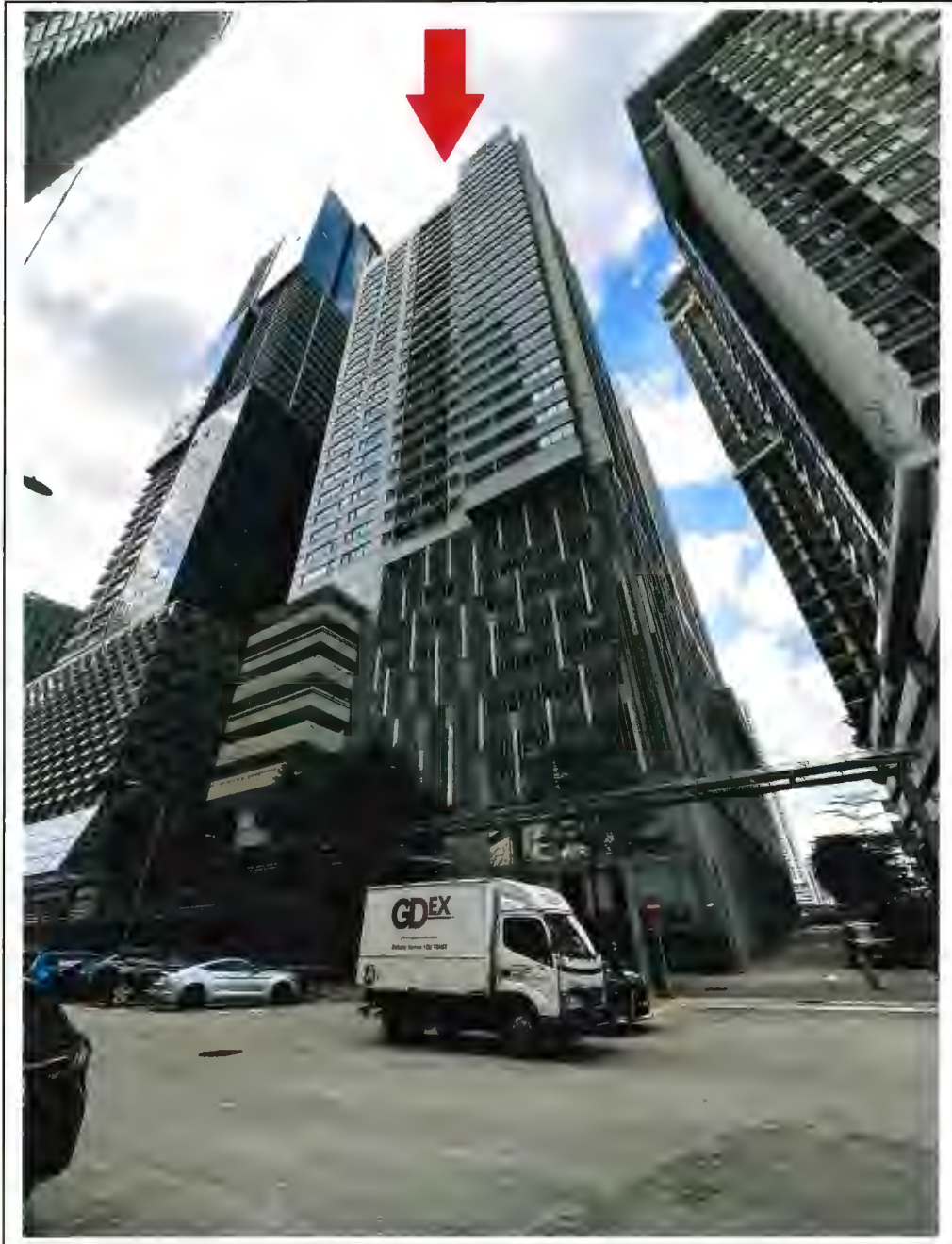
View of the block where the subject property is located