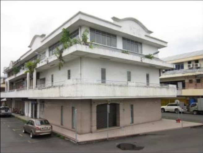
Front and Side View of Subject Property