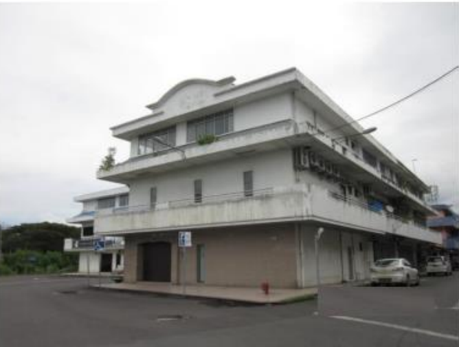
Rear and Side View of Subject Properties