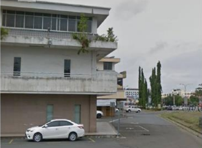
Front View and Road Access of Subject Property