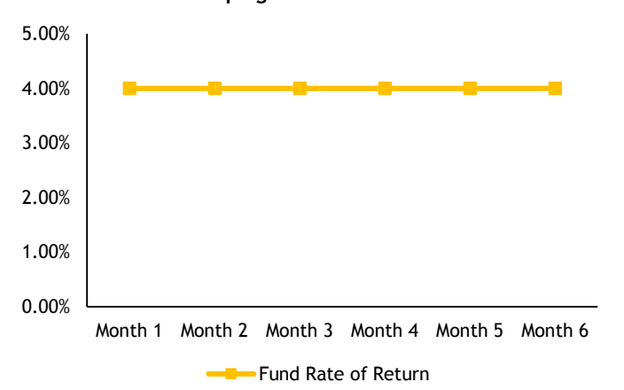
GIA-i 12 Campaign Historical Rate of Return

This section is applicable for customers who have made placement under the GIA-i 12 campaign from 1st October 2015 until 15th January 2016.