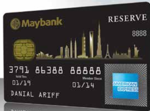
Maybank 2 Cards Reserve American Express Card

We thank you in choosing Maybank 2 Cards Premier as the best travel pair to accompany your every journey. Rest assured that this convenient pairing will maximise your rewards and benefits be it through global offers, points and VIP treatments, because you simply belong at the top of the world.