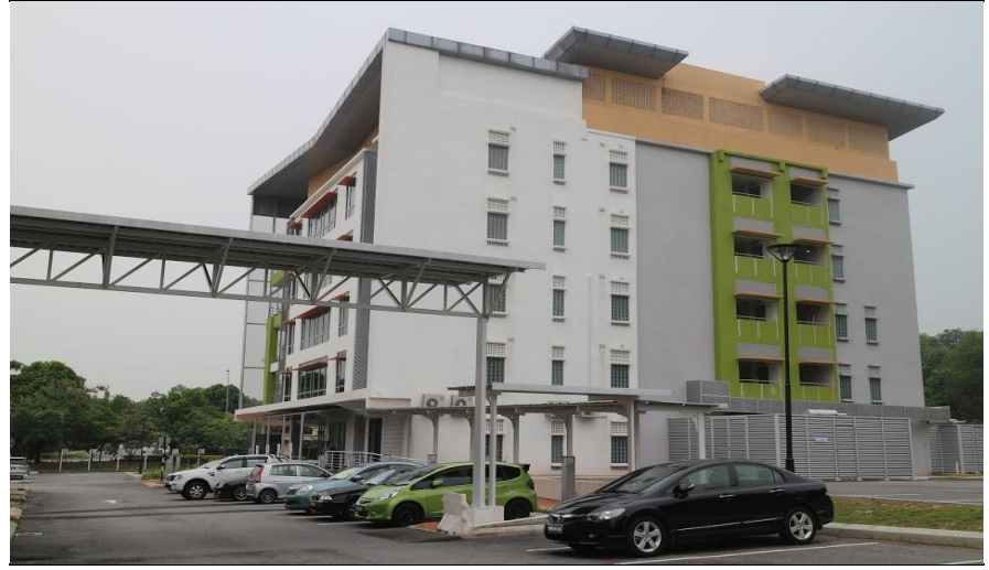
Fig 1: Digital Multimedia Broadcasting Hub

We organized a site visit to MYTV Broadcasting's (MYTV) Digital Multimedia Broadcasting Hub (DMBH) at Cyberjaya on 4 Feb 2016 to get an update on TV digitization in Malaysia. We were hosted by Mohamed Redzwan Yahya - COO, Haniza Ros Nasaruddin - CCO and Hamdan Mohamad - VP, Communications. To refresh your memory on TV digitization in Malaysia, please refer to our 27 Sep 2015 report (<u>link</u>).