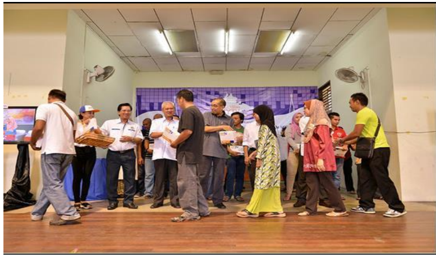
Fig 5: Presentation of test STBs in Kota Kinabalu, Sabah on 9 Aug 2015

Given that 98% coverage will likely be achieved in 2017, we understand that the analogue switch off (ASO) date has been scheduled for Jun 2018. By then, MYTV would have supplied 2m households with STBs. MYTV will commence supplying the 2m STBs in Aug 2016. The threshold for ASO is 90% of the 7m Malaysian TV households having STBs, integrated digital tuner TVs or Pay TV. We understand that the ASO date may be earlier if the 90% threshold is achieved earlier.