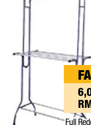
WM-747 MULTI LAYER CLOTH HANGER - Blue