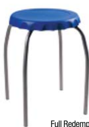
BELMO PLASTIC STAKING STOOL - Blue / Red / Black