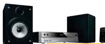
PHILIPS MCD120 DVD MICRO HIFI