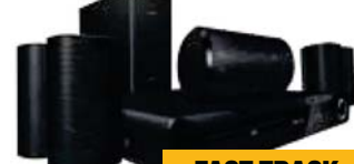
PHILIPS HTS3510 DVD HOME THEATER SYSTEM