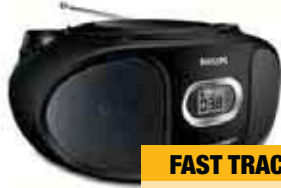
PHILIPS AZ302/98 RCR + MP3