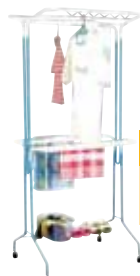
M-STAND 2 TIER CLOTH HANGER - Blue / White

Full Redemption 13,800pts SAVE 10,000pts