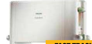
PHILIPS HD4815 TOASTER