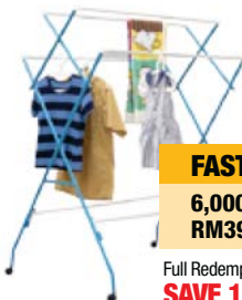
ECON CLOTH HANGER - Blue / White