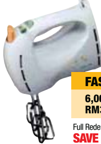
PHILIPS HR1456 HAND MIXER