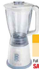
PHILIPS HR2027 BLENDER