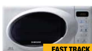
SAMSUNG MW83G MICROWAVE OVEN