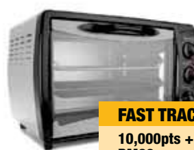
PENSONIC AE-19N ELECTRIC OVEN