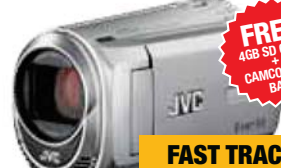
JVC GZ-MS215 FLASH MEMORY CAMCORDER

Full Redemption 89,800pts SAVE 10,000pts