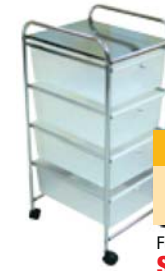
JHA4 4 TIER STORAGE TROLLEY - Silver